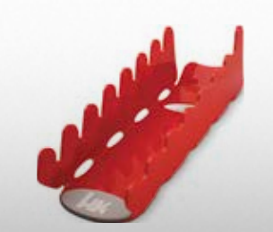
HK Knife Rack 984231F.....$25.00