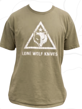
T-shirt S, M, L, XL MSRP.....